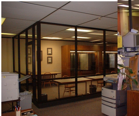
Arkansas State Archives 2006 after the remodel