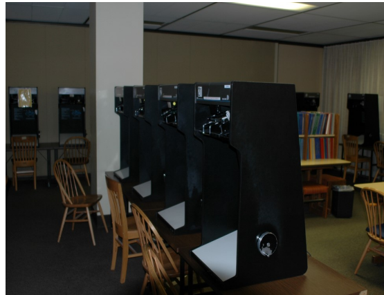
Arkansas State Archives 2006 before the remodel, Courtesy of the ASA

The FGS National Genealogy and Family History Conference will be held in Kansas City, Missouri.