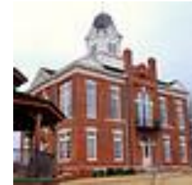
Paragould 1888 Historic Courthouse

If you have long desired input in preserving something of value in your area, here is your opportunity.