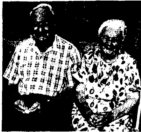
Married 65 Years